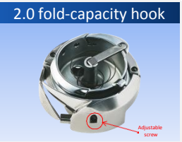
2.0 fold-capacity hook

New Lubrication system is powerful and stable even at low speeds.