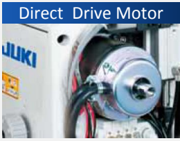
Direct Drive Motor

Single or double tension can be set easily and double tension is provided as standard.