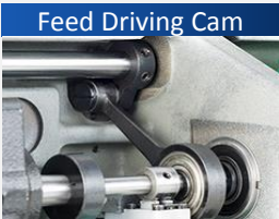
Feed Driving Cam

Bobbin thread spool device means it is no longer necessary to manually roll the thread.